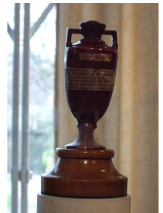
The Ashes Trophy